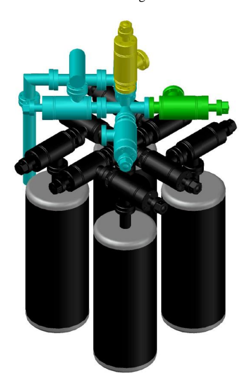
Figure 1. Tank assembly with valves to quadrupole volume (yellow), pumping station (green), and piercing tool (cyan valve at front).

Quadrupole mass spectrometer. The manifold is equipped with a 200 amu quadrupole mass spectrometer. This mass spectrometer will be used to monitor system blanks, and to provide a preliminary characterization of the CSVC gas.